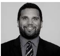
Moe Shoots Baltimore Ravens