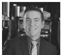
Thomas Yorke Horseshoe Casino