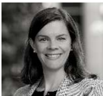
Catherine Patterson de Beaumont Foundation